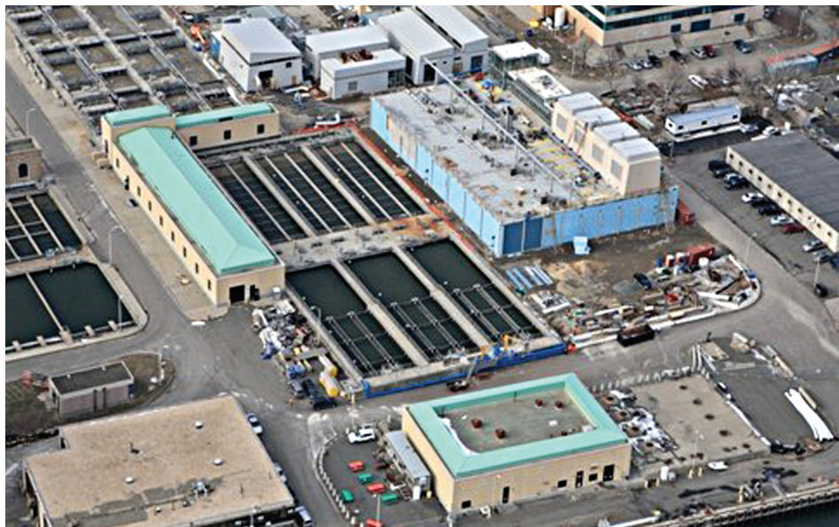
At the Wards Island biosolids processing complex, centrate from the centrifuge building (upper left) is sent to the SHARON building (light-blue-walled building on right). There, ammonia is converted to nitrogen gas after caustic soda and methanol are added.

Energy-efficiency projects at WWTPs are a key goal of New York City Mayor Michael Bloomberg’s official plans for a sustainable New York by 2030. According to Grontmij, SHARON produces 20% less carbon dioxide than